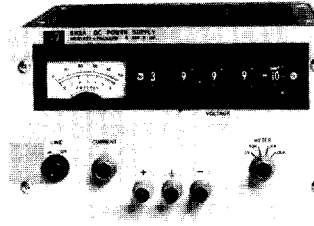
6111A, 6112A, 6113A, 6116A